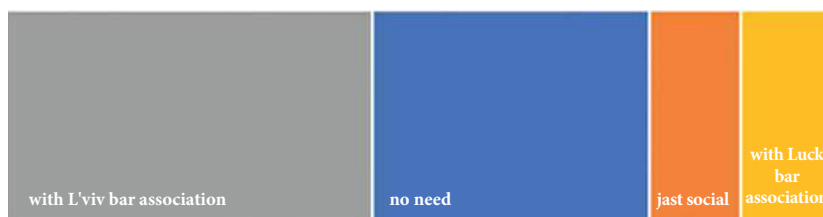
Figure 4 Cooperation of Polish-Ukrainian bar associations

fulfil various legal obligations, and conduct their own international activities. Additionally, at the central level, there are supreme organisations and other self-governing bodies whose task is to supervise, support, and coordinate regional organisations. Nevertheless, it is the regions that carry out most of the tasks and responsibilities. In both Poland and Ukraine, lawyers and legal advisers are obliged to become members of the bar association. Regional and supreme corporate bodies conduct activities of an international nature, which result from the provisions of national or international law (e.g., maintaining lists of foreign lawyers, cross-border disciplinary proceedings), or the ambitions of members of boards of directors (councils) of regional associations (e.g., organisation of international training, conferences, internships, representation in international organisations, promotion of cross-national issues, or international social events). 38